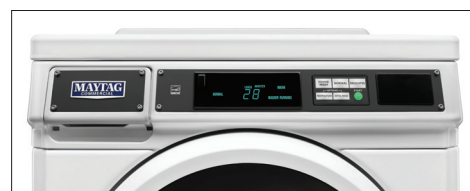
CARD READER READY & NON-VEND MHN33PNCGW (pictured)