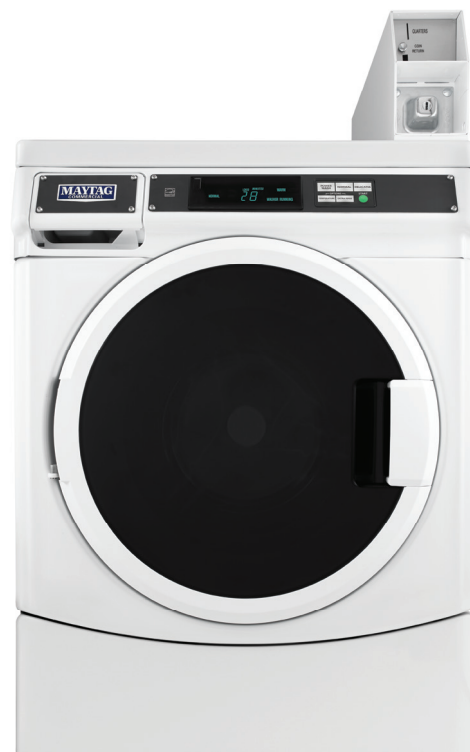
COIN READY MHN33PDCGW (pictured)